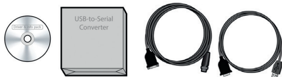
Computer program connection kit