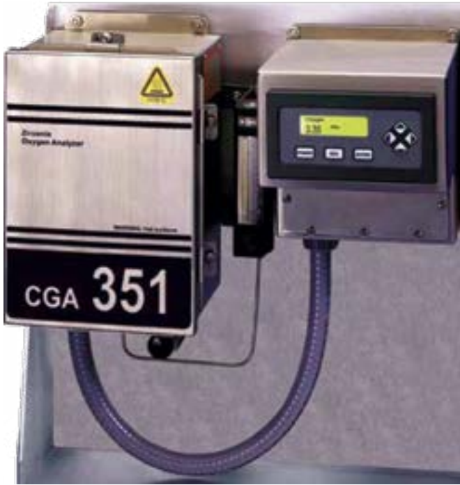
Wall mount version of CGA 351